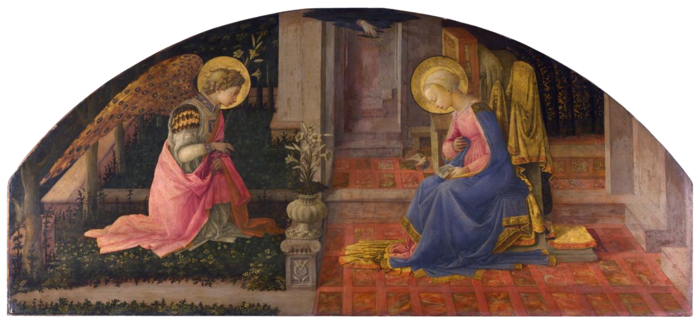
"The Annunciation" by Filippo Lippi, 15th century